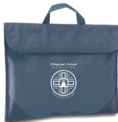
Library Folio $ 14.00