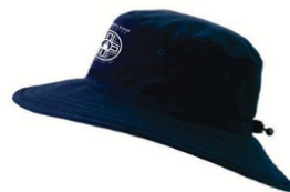
Hybrid Bucket Hat $ 18.00