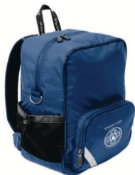
School Backpack $ 58.00