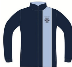
Soft shell Jacket $ 82.00