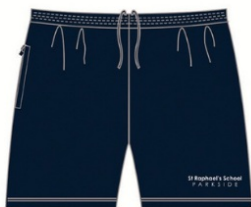
Shorts $ 30.50