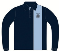
Polo Long Sleeve $ 45.50