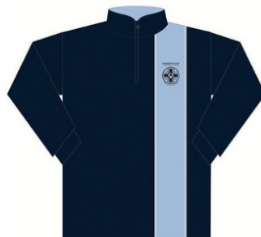
Boss Top $ 52.50