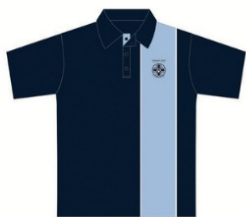
Polo Short Sleeve $ 40.00