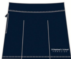
Skort $ 29.00